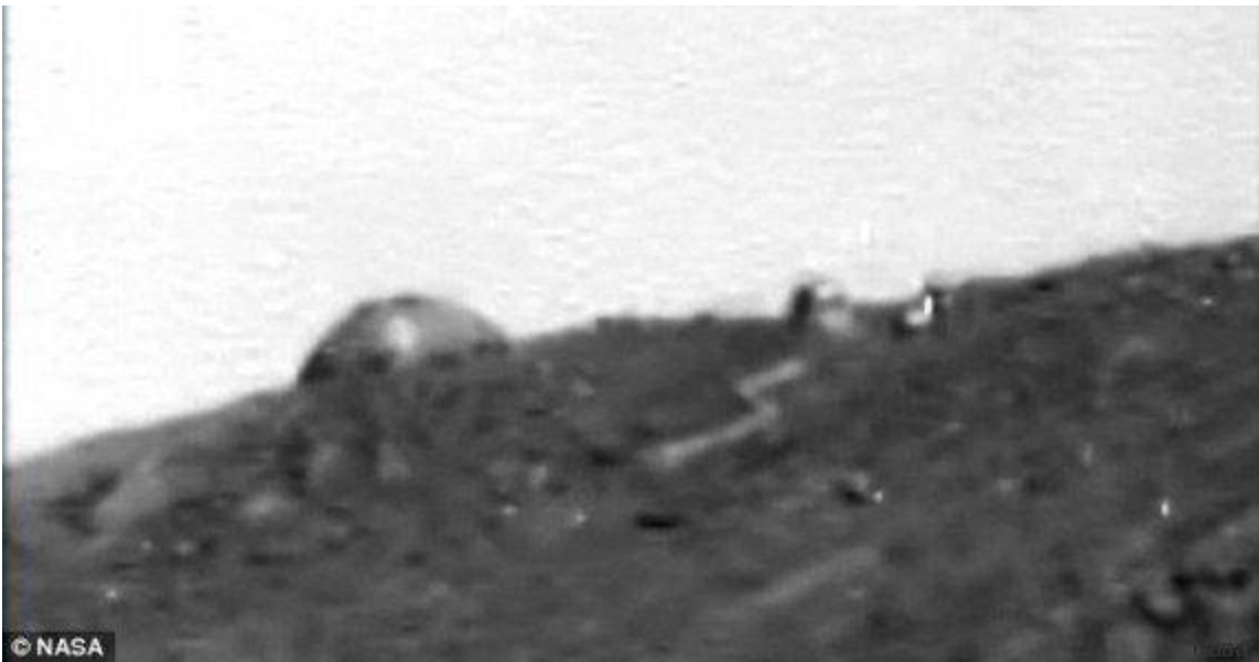
Mars alien structures